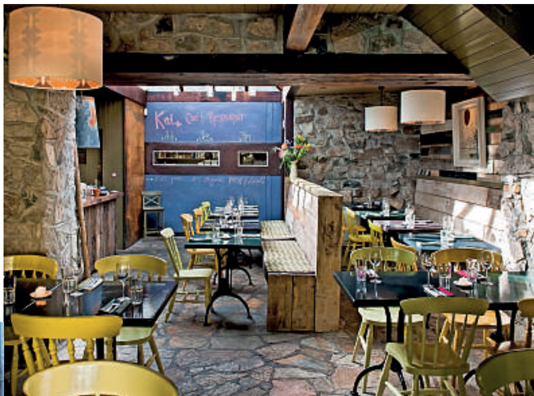
CLOCKWISE FROM TOP LEFT Fresh fish and chips at Kettle of Fish; Kai's quirky interior; retro signage pulls the tourists in to one of Galway's many friendly pubs.